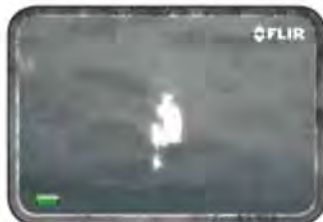
FLIR Thermal Heat signature