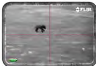
Fox in Black Hot