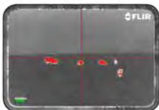
Hogs in InstAlert™

The R-Series offers up to six different detection palettes, including FLIR's exclusive InstAlert™, which displays the hottest temperatures in red so you can detect animals, people and other warm objects more easily.