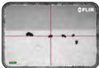
Hogs in Black Hot