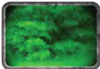
Conventional I 2 optics